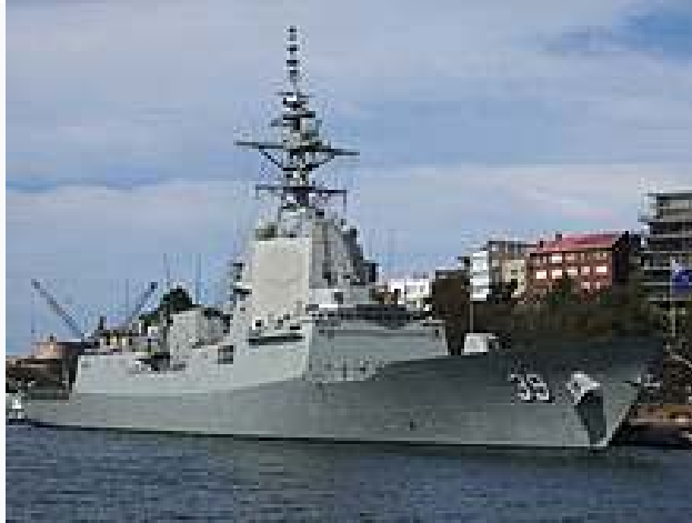
HMAS Hobart in December 2017

The Australian Air Warfare Destroyer (AWD) project commenced in 2000, to replace the Adelaide-class frigates and restore the capability last exhibited by the Perth-class destroyers . The ship was assembled from 31 pre-fabricated modules ("blocks"): 12 for the hull, 9 for the forward superstructure, and 10 for the aft superstructure. The Hobarts are built around the Aegis combat system . The first ship HMAS Hobart was