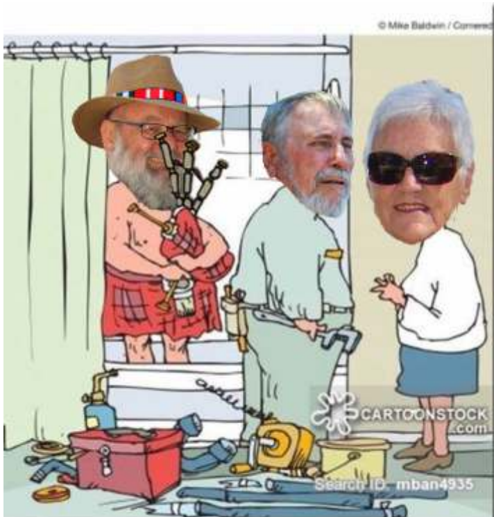
"These older homes are tricky. You never know what kind of pipes you'll find."