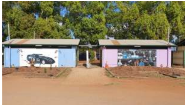
again another town with Lodgings