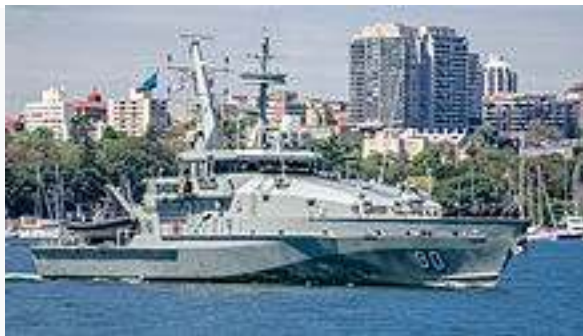
Armidale-class patrol boat HMAS Broome

For patrol of Australia's vast coastline, territorial waters, and offshore territories, the RAN operates thirteen Armidale-class patrol boats. These replaced the Fremantle class from 2005 as the navy's primary asset for border protection, fisheries patrols, and interception of unauthorised arrivals by sea. Based on the Bay-class customs vessels, the Armidales are significantly enlarged to allow for better range and seakeeping ability. Originally, twelve boats were to be built by Austal Ships , but the establishment of a dedicated patrol force for the North West Shelf Venture saw another two ordered. The Australian Patrol Boat Group has divided the class into four divisions, with three ships' companies assigned for every two vessels to achieve higher operational availability. HMAS Bundaberg was decommissioned in December 2014 after being extensively damaged by an onboard fire. [6] Ongoing problems with the patrol boats, including wear from high operational use and structural issues, prompted the RAN to acquire two Cap class patrol boats from the Australian Border Force . [6]