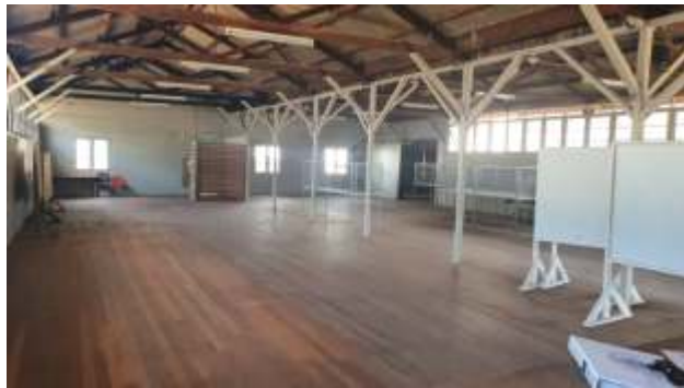
Showground huts for Lodgings

Kedron Wavell RSL Sub-Branch have agreed to also join us and a couple of them will bung on the helmet, hop on a bike and be a part of the event. They have also generously agreed to provide a small bus, a ute and also a mobile kitchen (the Chuck Wagon) as well as a cook who will look after our breakfasts and smokos along the way. Two of the days will be long, unfortunately there is no way we can avoid that, but the kitchen will head off ahead and set up along the way to provide a bit of relief.