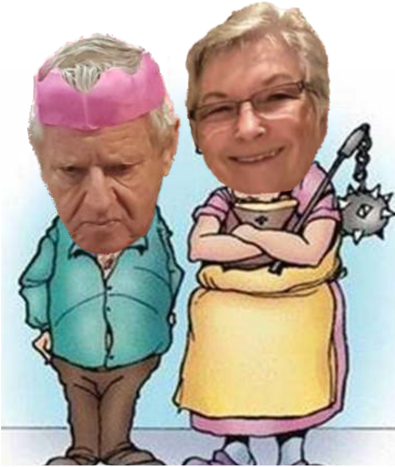
"Pretend you're a purse snatcher... I wanna try something."