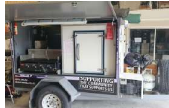
The support Mobile Kitchen

Its a well planned out 14 day journey of 2100km averaging 150km each day broken down into shorter legs by way or morning tea, lunch afternoon stops then the overnight lodgings so its not overly oneruous or taxing on the body